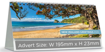
Advert Size: W 195mm x H 23mm