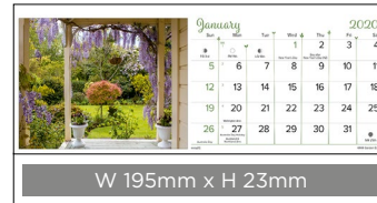
Garden Estates Desk