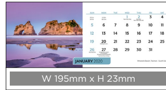
NZ Greetings Desk