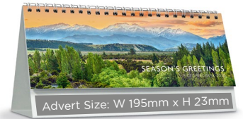
Advert Size: W 195mm x H 23mm