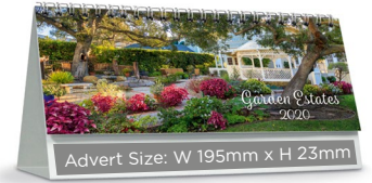
Advert Size: W 195mm x H 23mm