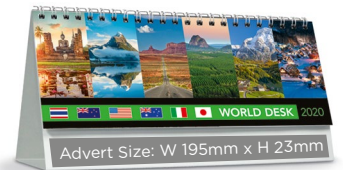
Advert Size: W 195mm x H 23mm