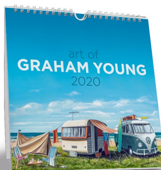
Experience New Zealand